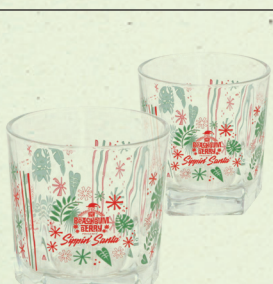
SIPPIN' SANTA ROCKS GLASSES SET OF TWO (9.5oz)