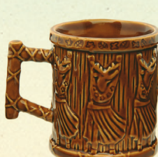
TIKI HOT MUG (8oz)