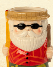
SURFIN' SANTA MUG (16oz)