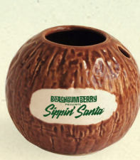
BEACHBUM BERRY SIPPIN' SANTA COCONUT MUG (15oz)