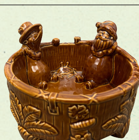
SIPPIN' SANTA TIKI TUB COMMUNAL-BOWL (36oz)