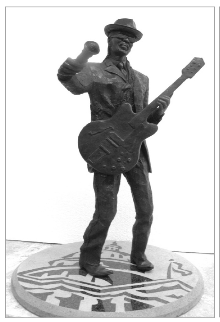
Proposal 2: Vinnie Bagwell "Put Your Hands Up"